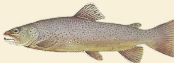
Sea Run Brown Trout

The future of this program depends on these fish being reported.